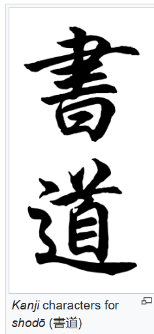
Kanji characters for shodō (書道)