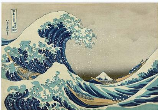
Woodblock print The Great Wave off Kanagawa by Katsushika Hokusai, Edo period

This Is How Japan Schools Teach Cleanliness