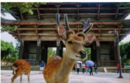
Nara Deer Park

Every morning, about 1200 wild deer gather in front of Todaiji Temple, Nara. You can buy special biscuits outside of the temple to feed them. Before you hand over the treat, give a little bow. The deer will bow back at you!