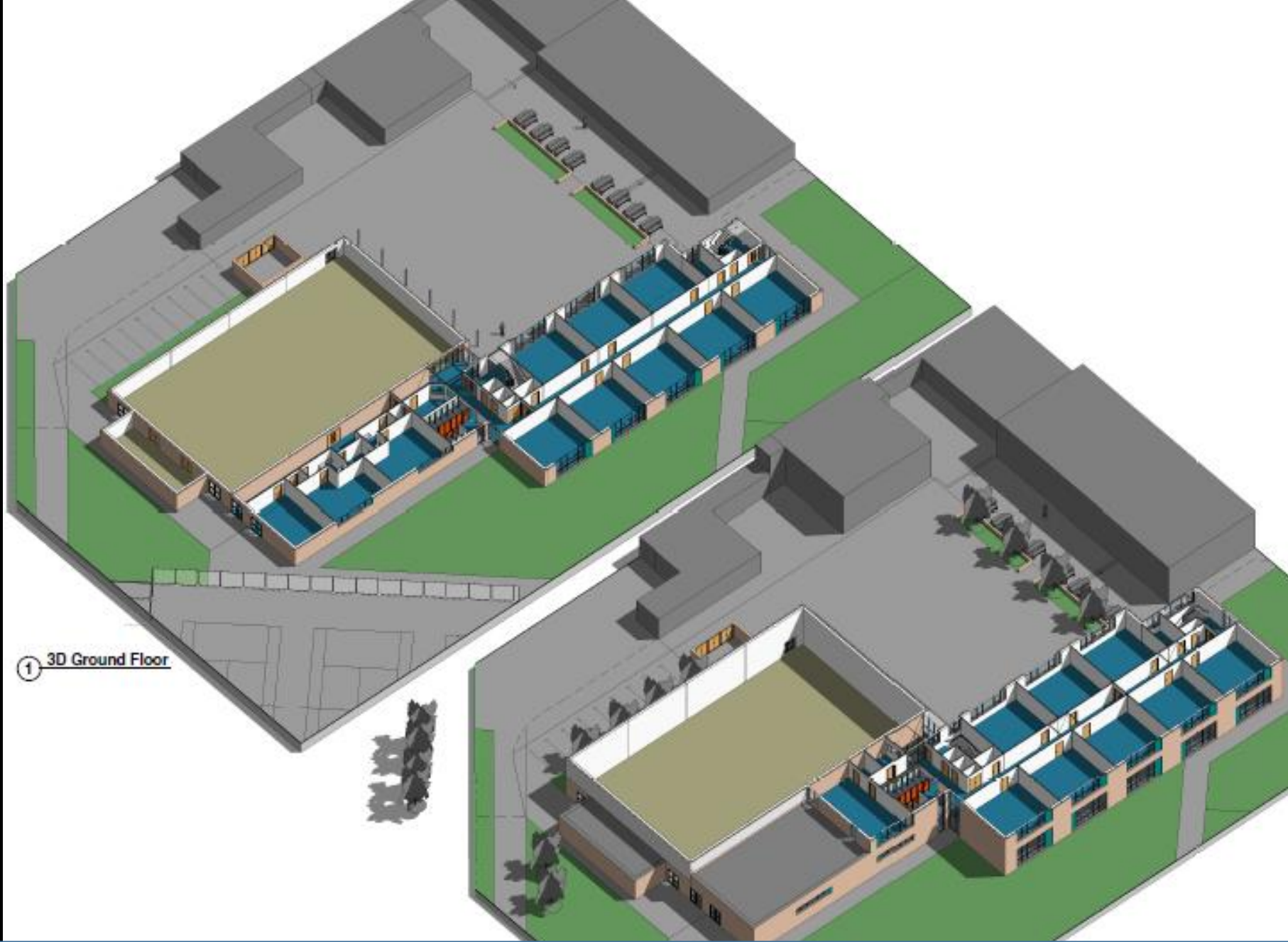
① 3D Ground Floor