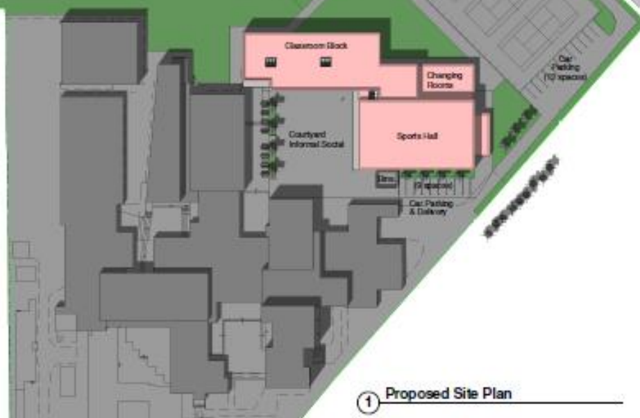
① Proposed Site Plan