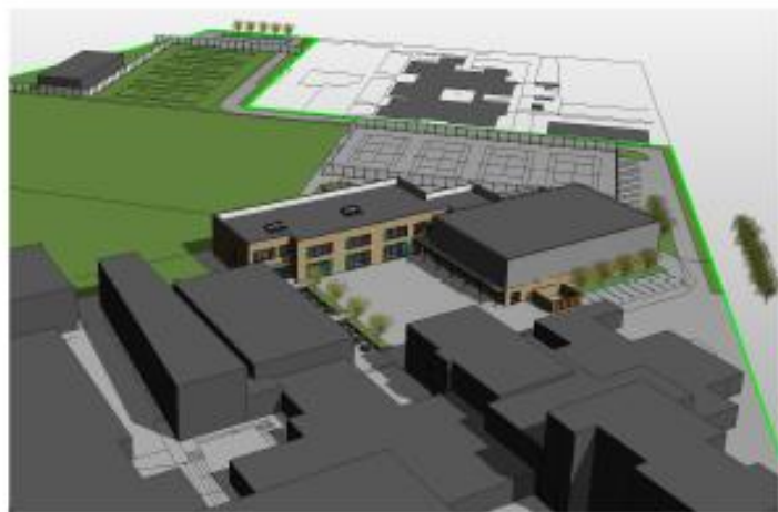
② Aerial Perspective